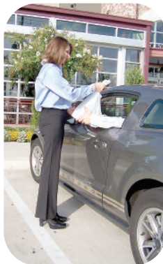
Order is delivered promptly