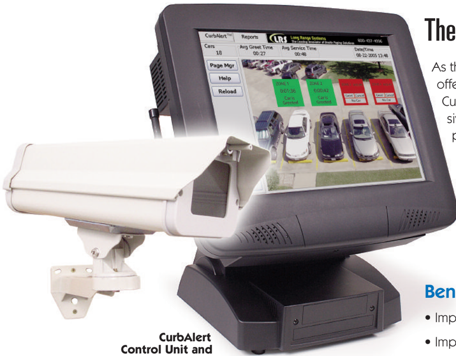
CurbAlert Control Unit and Video Camera